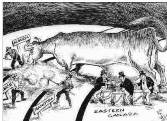
Illustration from 1915.

The resources have been exploited for the benefit of everyone but Westerners. But what's more, resources have been regulated by eastern Canada. An example of which is the present day usurping of Alberta's oil industry, actions that largely benefit American and Saudi interests.