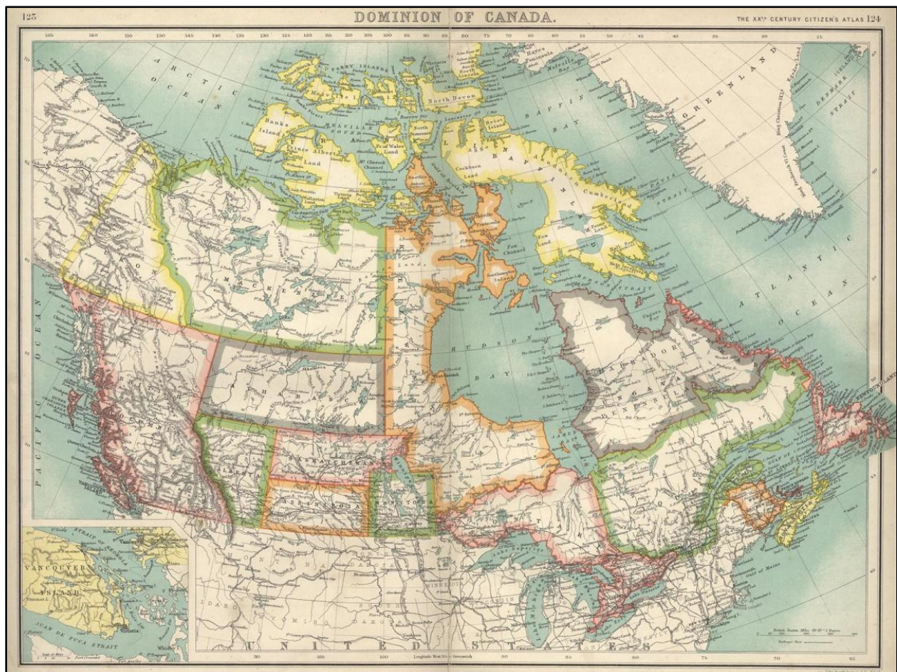
Canada in 1900.

Canada has changed many times. The borders we now know have been drawn and redrawn, reaching what Canada looks like today with its provinces and territories. Recently, the Northwest Territories changed to include Nunavut. Change is the only real constant.