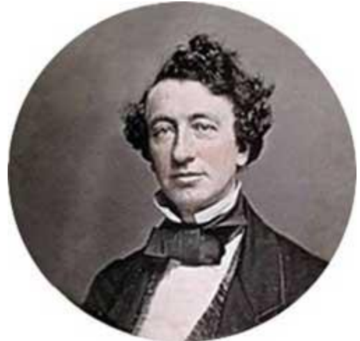
Sir John A. Macdonald

By seceding and going our own way we have an opportunity to take back what was ours for our benefit.